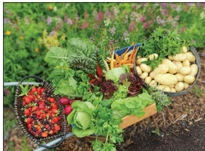
Produce from a community garden.