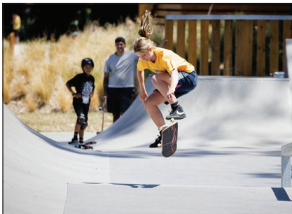
Doing tricks at a skate park.

community garden – a garden where people in the community grow food to share.