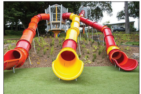
Slides at a children's playground.