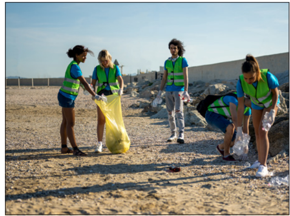
Volunteers at a beach clean-up