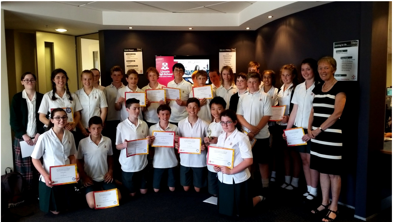
A large number of students received awards last Thursday from the Principal.