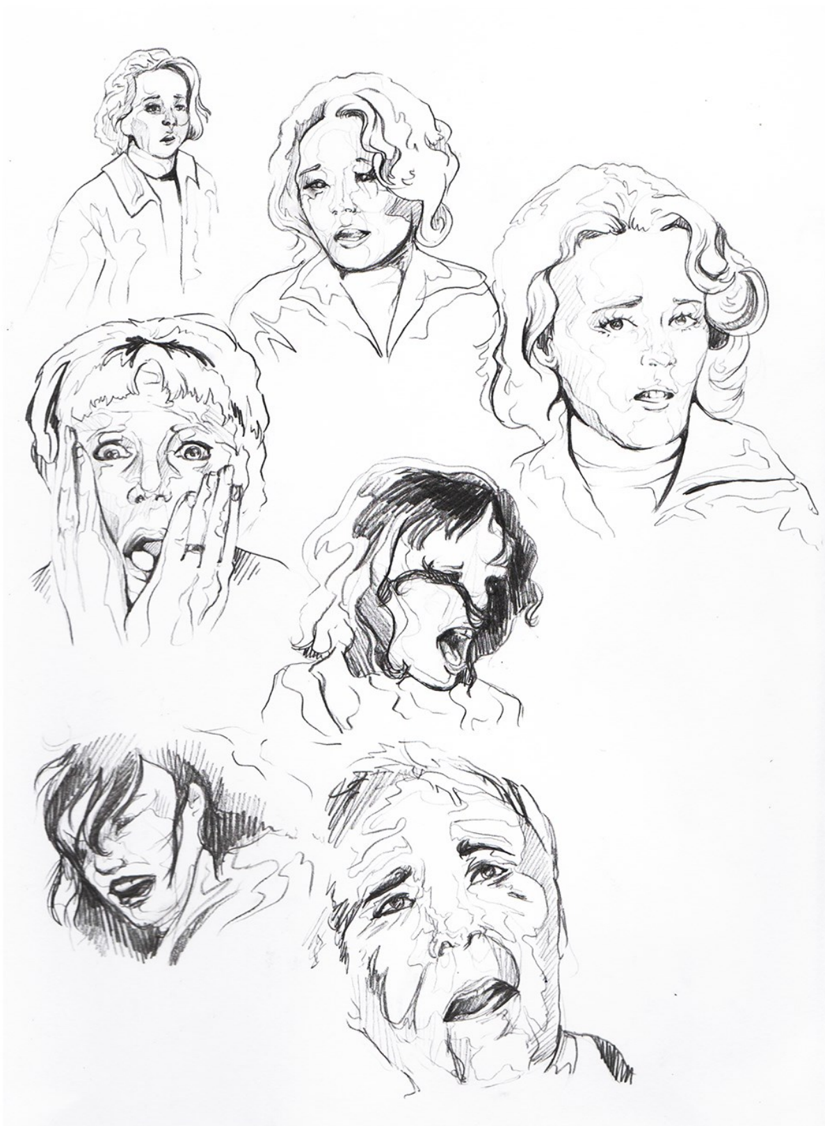
Brittany Glassey Year 13 Printmaking Drawing study from Alfred Hitchcocks The Birds Graphite on paper