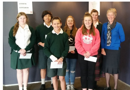
Students receive their letters of congratulation for Debating, Stage Challenge, Japan Exchange and Badminton.

We have used student, parent, and staff feedback, consulted other educators, visited other schools and read available research to inform our decisions. Shortly we will share our