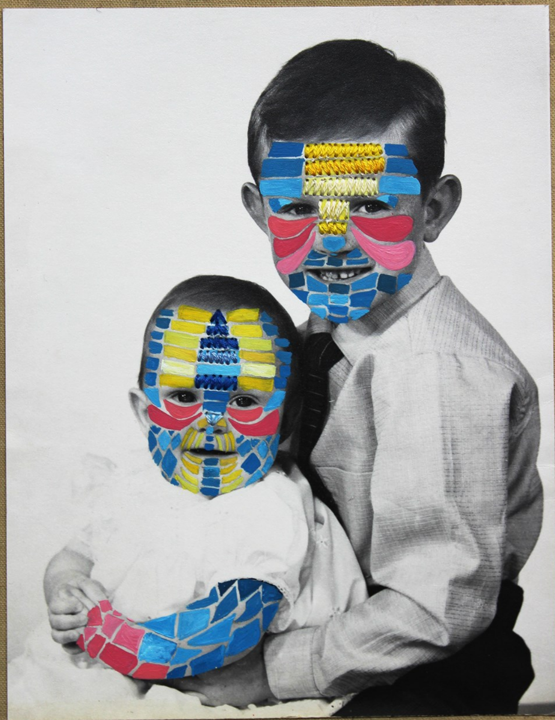
Kara Harris Y13 Photography. Found Photograph, stitching and acrylic Paint. 2014