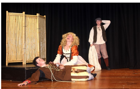
Scenes from 'A Midsummer Night's Dream'