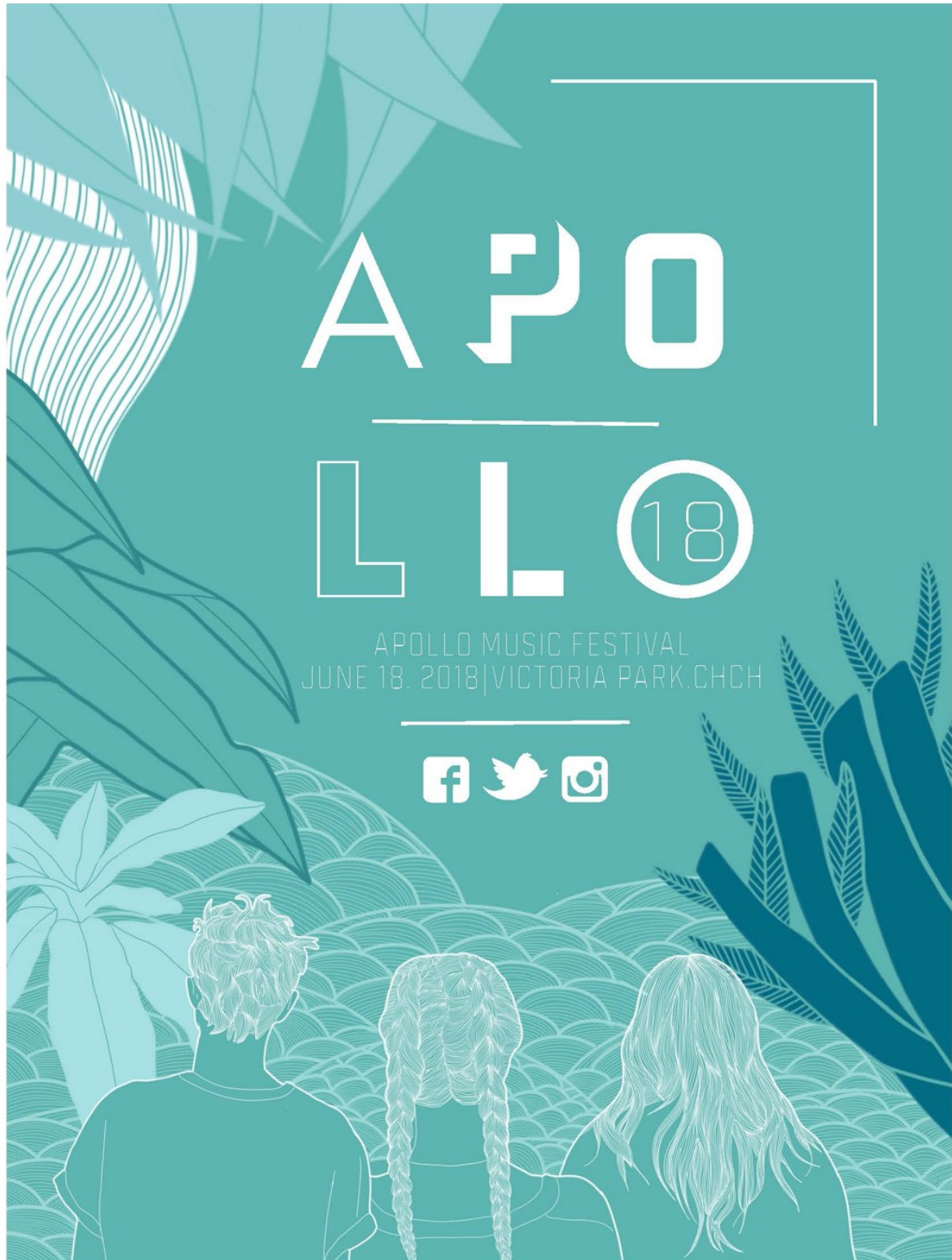
Jessica Swarbrick Y13 Design Digital Drawing for promotional poster