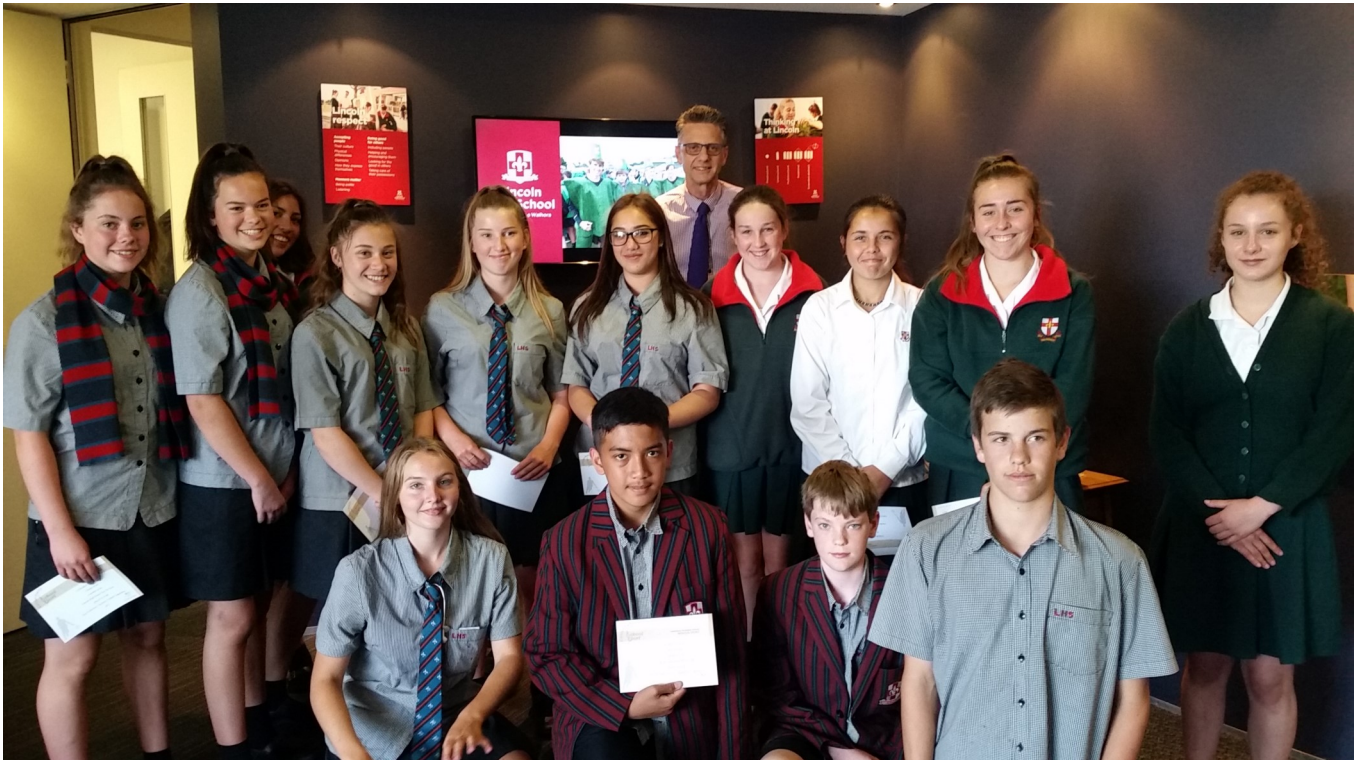
Students receive congratulation certificates for Sport from the Deputy Principal