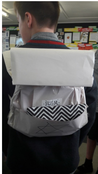
These two photos were the winning newspaper backpacks