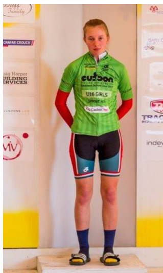
Sprint Ace Jersey (1 st on points)