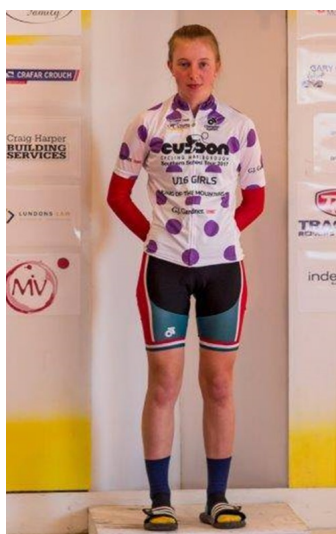
King of the Mountain Jersey (1 st on points)