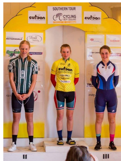
Tour Leader's Jersey (1 st on points for four races)