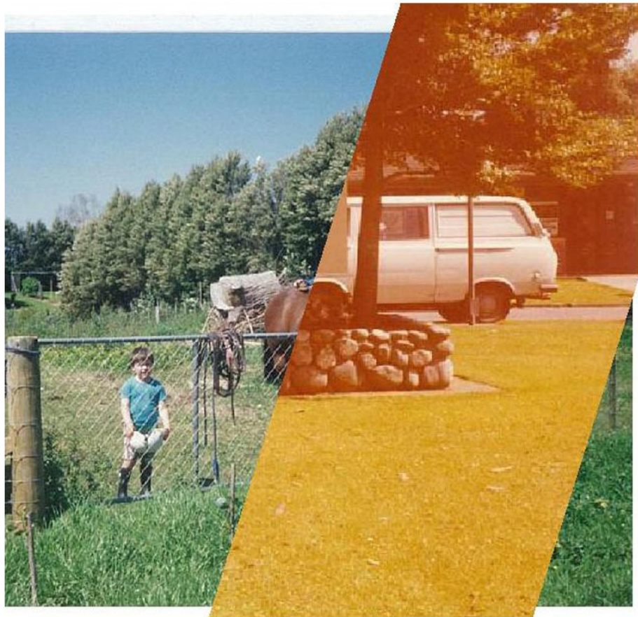
Caitlin Cherry Y13 Photography Digital Collage