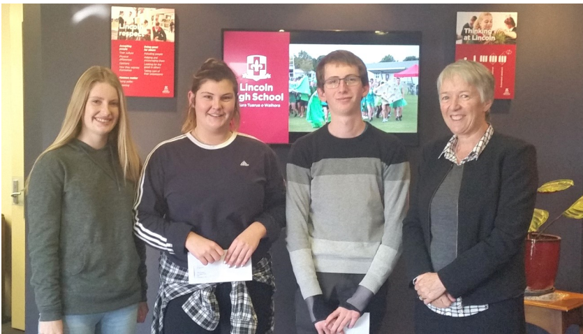
Students receiving Achievement letters of congratulations from the Principal.