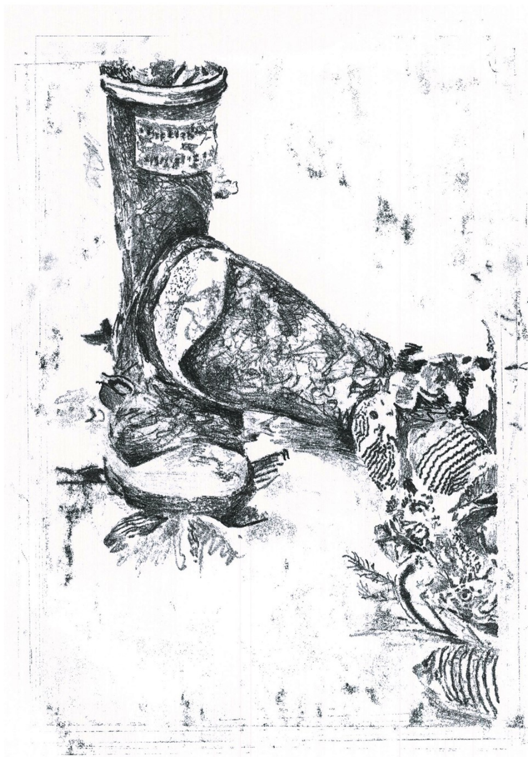
Georgia Gwatkin Y11 Monotype 2017 297mm x 4200mm