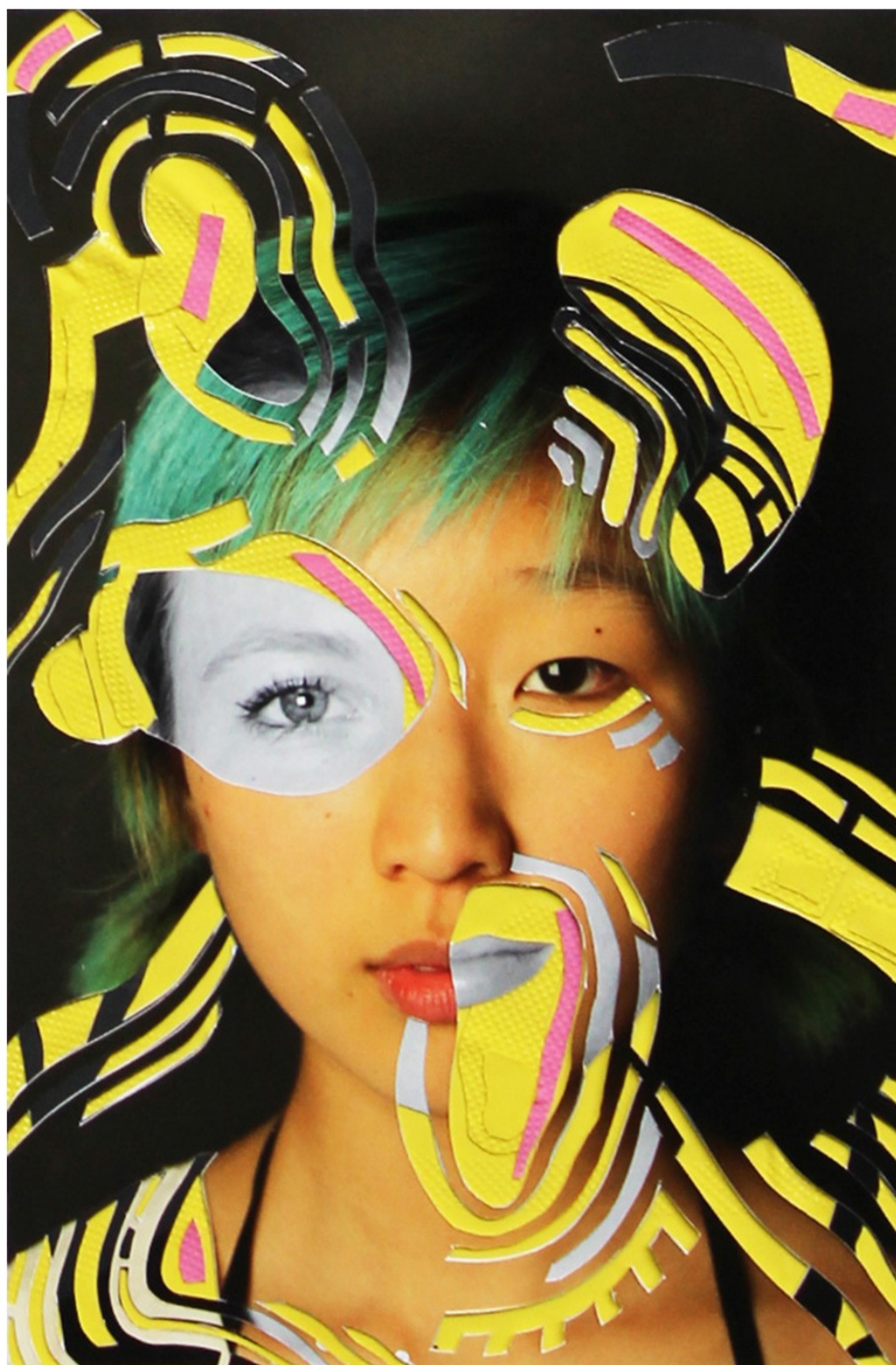
Eboni Hill Y13 Photography 2015 Digital Ink Jet Print and rubber glove collage. 210 x 297 mm