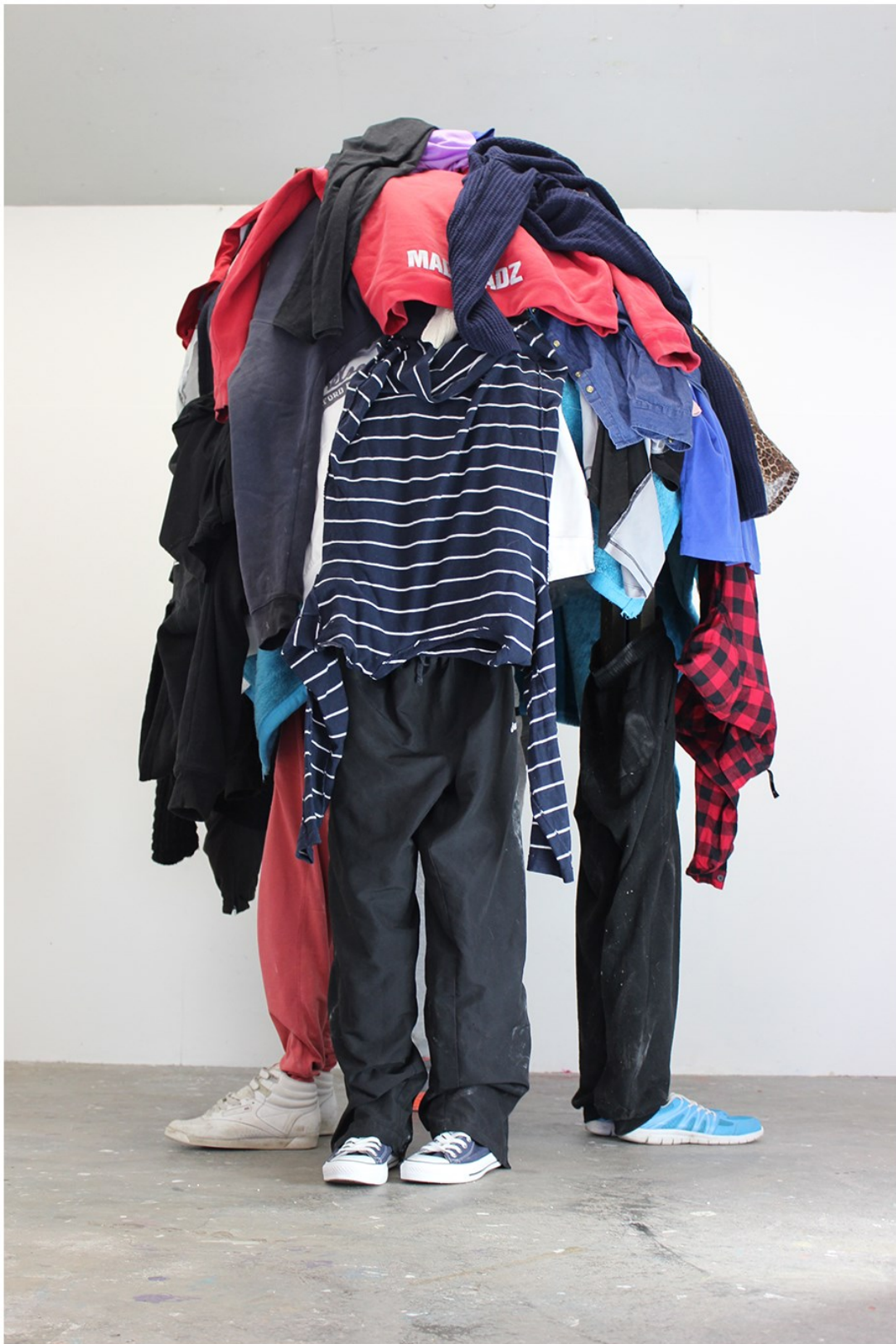
Maddie Ewan Y13 Sculpture 2015