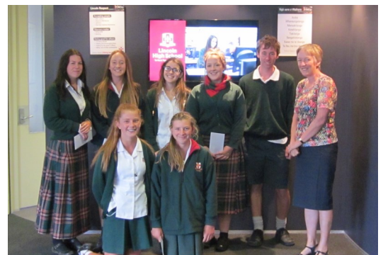
Students receive letters of congratulation for their achievement efforts.